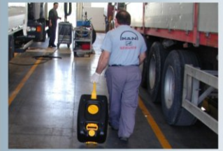
Handy and convenient to carry