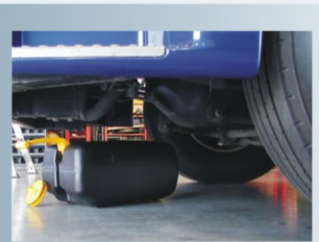
Making waste oil disposal easier