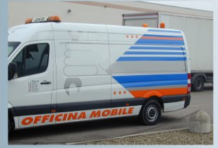
Used by rescue and/or emergency vehicles for external operations such as repairing and/or hazardous liquids containment

Handle to make lifting and emptying easier